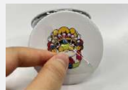
Tear off the Transfer Film