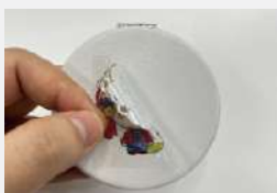
Separate the Film A-and B apart