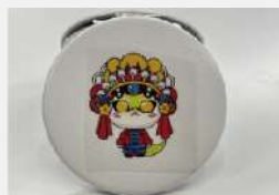
Stick the Transfer Film