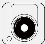
Vivid printing photo quality

AJ-360C is a specially designed and developed industrial-grade color UV inkjet printer for cylinders/cones, which is widely used in vacuum flasks, cups, cosmetic packaging bottles, wine bottles, aluminum cans, and other industrial and daily cylindrical/conical packaging.