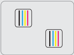
* 1.6m Dual I3200-E1 Print Heads Speed