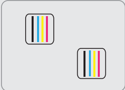
* 1.6m Signle I3200-E1 Print Heads Speed