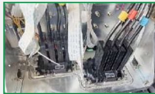
Moisturizing cleaning assembly