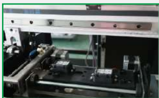
Automatic moisturizing cleaning assembly ensures the stability output