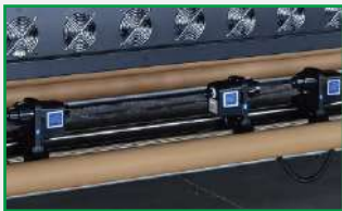
External power supply, intelligent rolling system