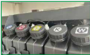
500ml large capacity ink supply system.stable ink supply