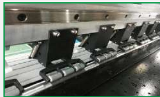
New pinch roller structure of three in group brings more stable feeding precision.