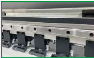
High quality imported THK high precision guide rail