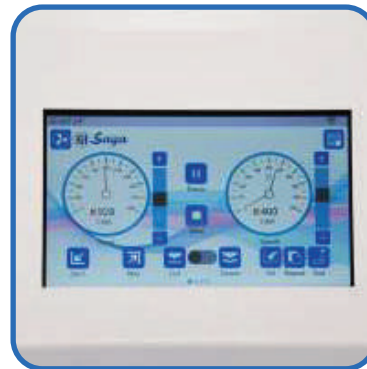
7-INCH FULL TOUCH SCREEN