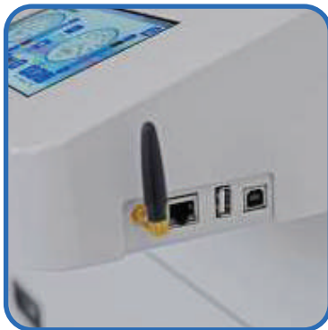
MULTIPLE CONNECTION METHODS