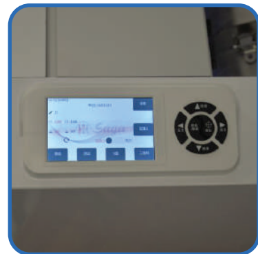
4.3" TOUCH SCREEN