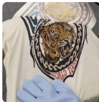
No Fussy Mess