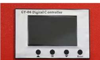
GY-06 Digital Control

The intuitive control panel and clear display make operation simple and efficient. The auto-open feature automatically releases the finished lanyard, reducing manual handling and increasing productivity.