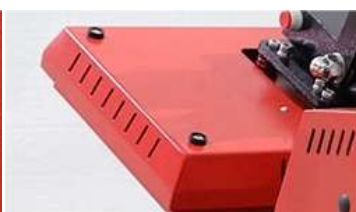
Thermal Protection Cover