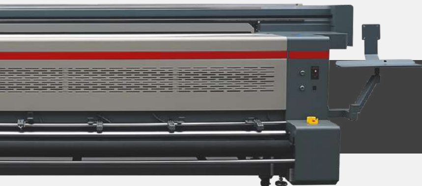
DIRECT DYE-SUB PRINTER MODEL: CSP-3208

* Use the original operating system. If you are using priated operating system, we are not responsible for any damage to machine workings, and also the warranty terms will become void.