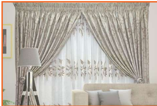
02 DECORATIVE CLOTH