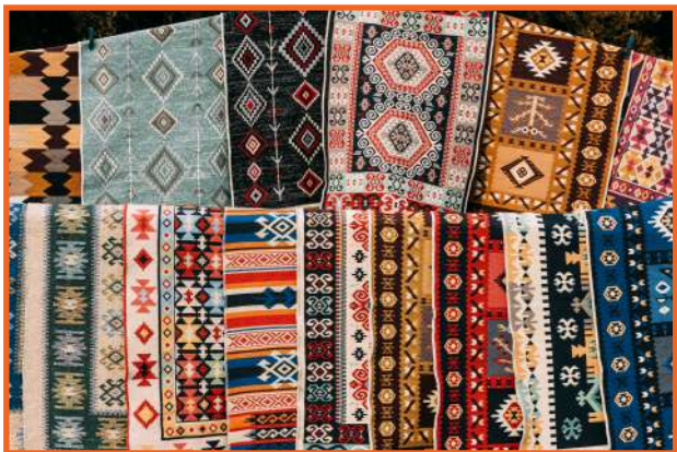
01 PRINTED CARPET