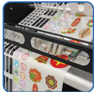
WASTING & SILTTING & REWINDING