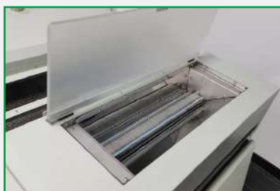
Flip top powder box, simple operation , convenient to add powde.