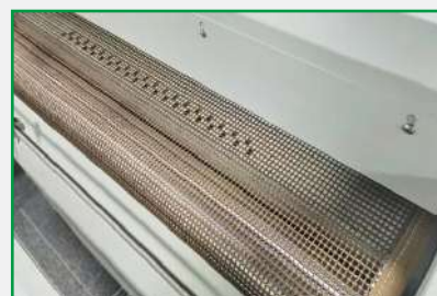
Efficient powder shaking device, powder shaking is clean