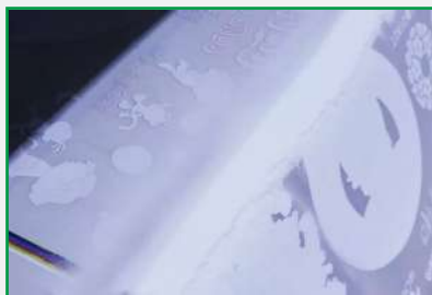
High-Quality hot-melpowdei can be used repeatedly.