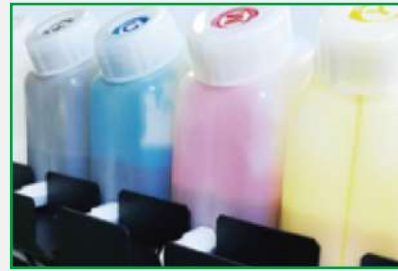
1.5L Stable Ink Supply System Ensures Amazing Printing Quality.