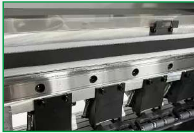
THK High-Precisionmute Rail.