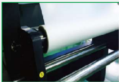
High-Performance Paper Collection Service Adapt too Variety of Materials.