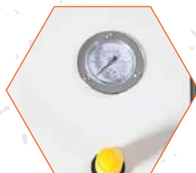
Air Pressure Controller