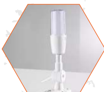
Machine Running Indicator