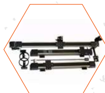
High-Precision Slider Group