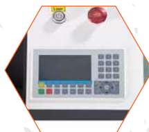
RD Control Panel