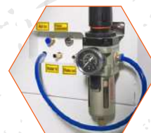
Oil Water Separator