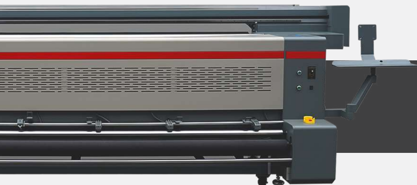
DIRECT DYE-SUB PRINTER MODEL: CSP-2108

* Use the original operating system. If you are using priated operating system, we are not responsible for any damage to machine workings, and also the warranty terms will become void.